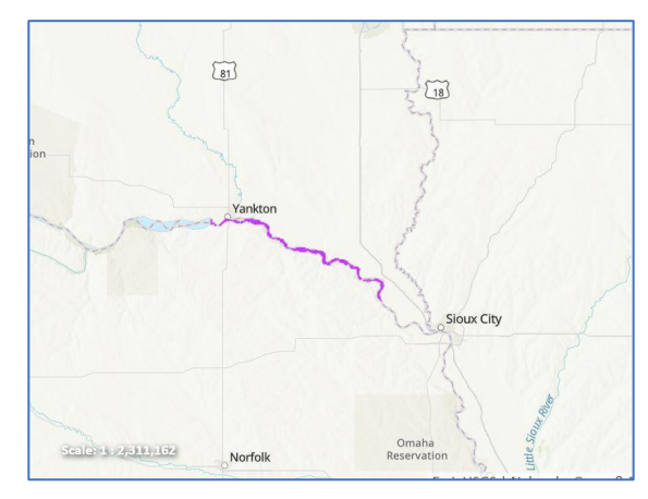
Figure 1: FWS ECOS Map